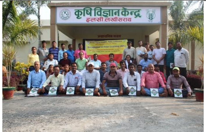
Skill development training of Ag. Ext. Service Provider (RPL)