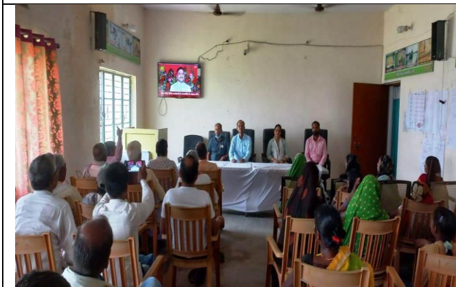
PM Live Programme on 31 st May 2022