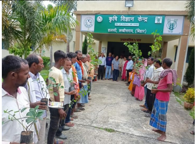
Poshan Abhiyan on 17 sept. 2022