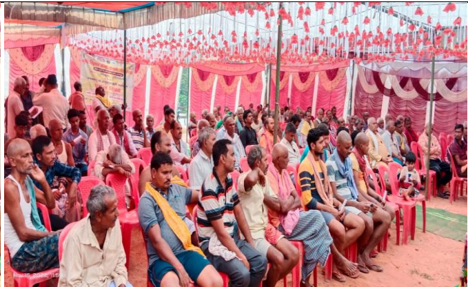
Field Day at Rampur village on 15 th Nov 2022