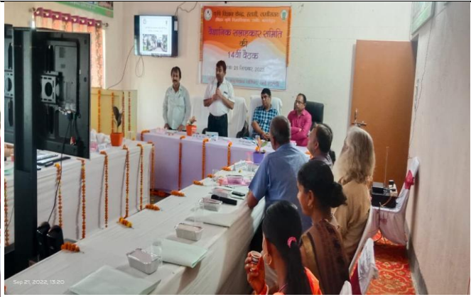
SAC Meeting 21 st Sep. 2022