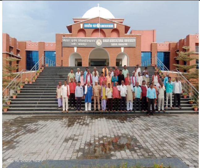
Exposure Visit of farmers