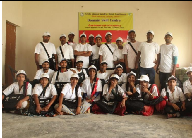
Skill development training of gardener (Domain)