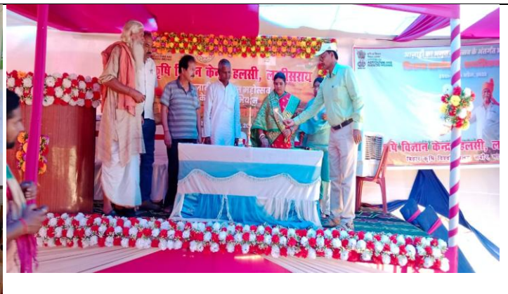
Kisan Mela 4 th April 2022