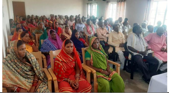
15 th Oct. Mahila Kisan Diwas