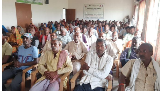
PM Kisan Samman on 17 th Oct 2022