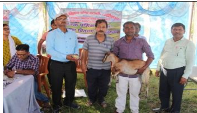
Activites under NICRA