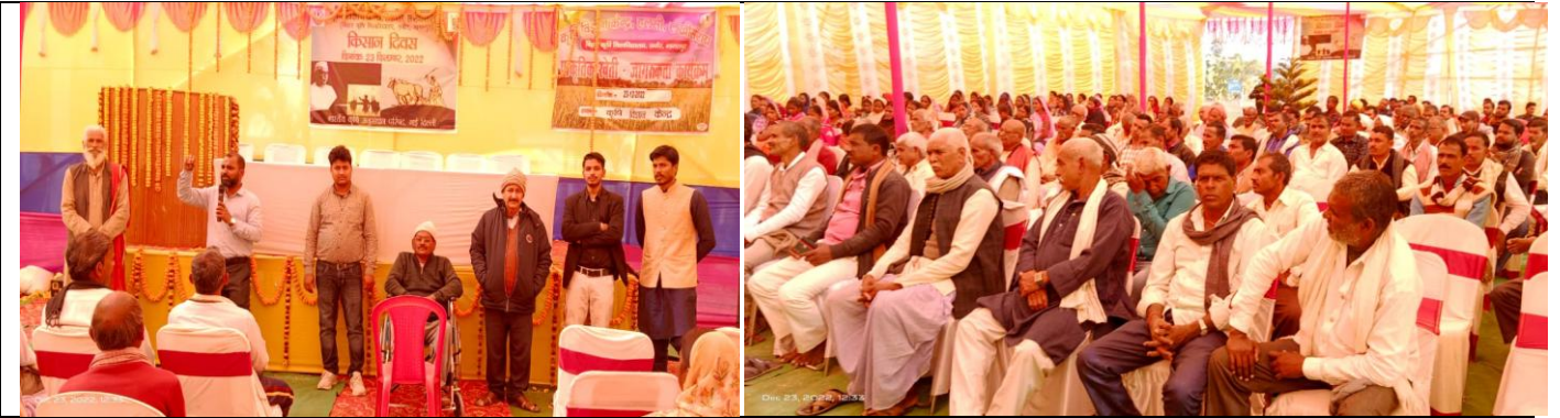
Kisan Diwas cum Awareness programe on Natural farming on 23 rd Dec 2022