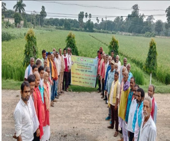
Exposure Visit of farmers